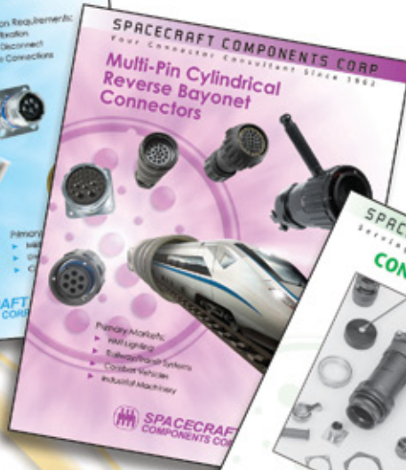
SCPB SERIES (CATALOG 302)