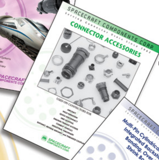
CONNECTOR ACCESSORIES (CATALOG 401)