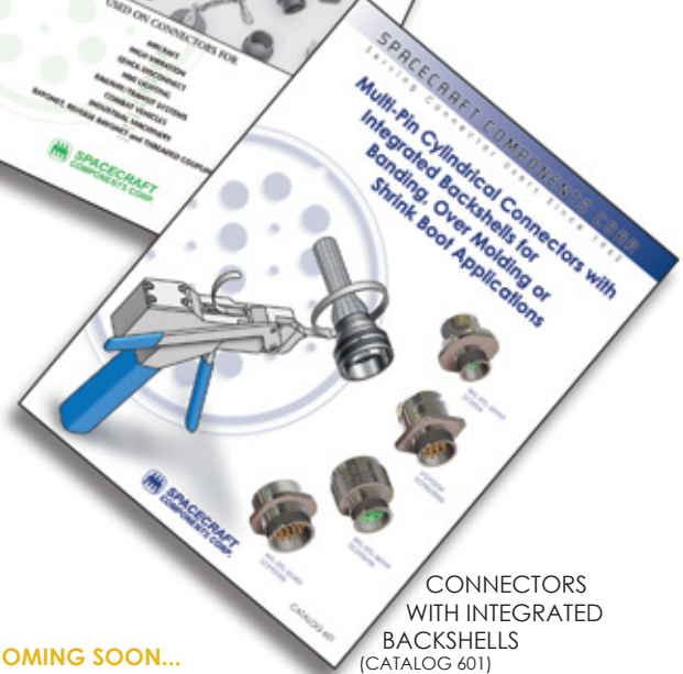
CONNECTORS WITH INTEGRATED BACKSHELLS (CATALOG 601)