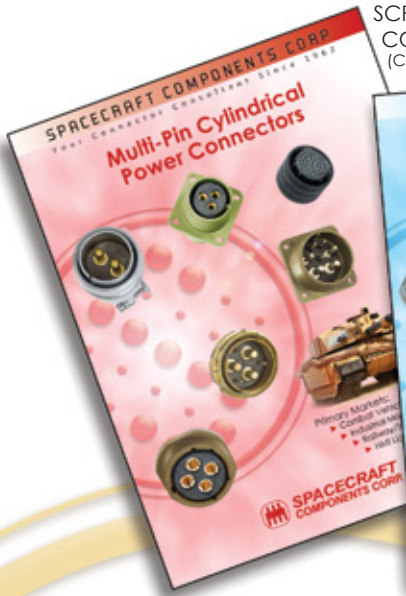
SCP 5015 STYLE CONNECTORS (CATALOG 102)